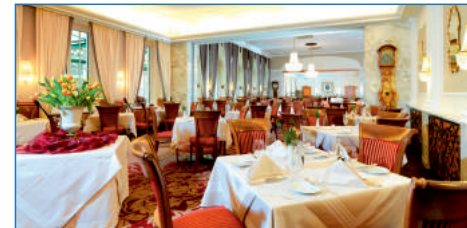
The ballroom of the Hotel Stefanie in Vienna

Cost: 60,- €/person (incl. buffet, without drinks), registration required