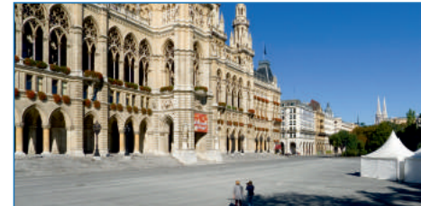
The historic City Hall of the City of Vienna