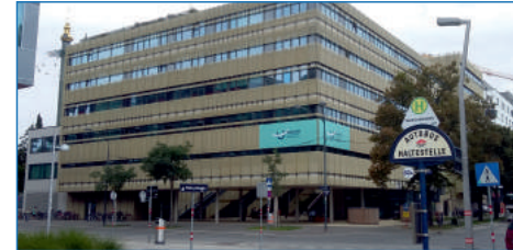
Sigmund Freud University Vienna

free of charge, no registration required